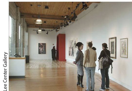
Lee Center Gallery

Over 70% of the student body participates in community service through volunteerism, internships, and professional encounters. Faculty and student service contributions account for over $6 million per year being invested in the area’s nonprofit, government, educational, medical, and business communities. At the Center for Service and Community Engagement, students are connected with local volunteer needs in shelters, schools, care-giving facilities, hospitals, and criminal justice institutions. In turn, leaders from these institutions often speak, teach, and mentor on campus. Through these and other services, connections continue to multiply between Seattle University’s campus community, its surrounding neighborhood, and the community-at-large.