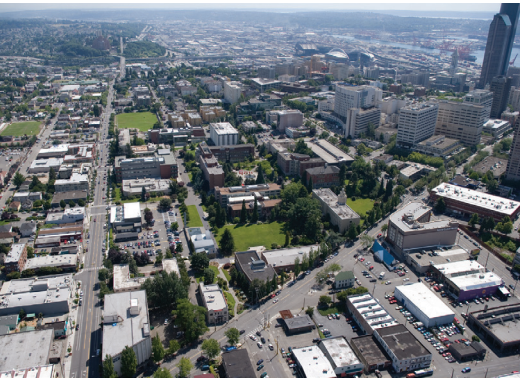
Aerial View of Campus Looking Southwest