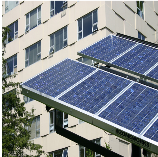
Photovoltaics on E. Cherry St.