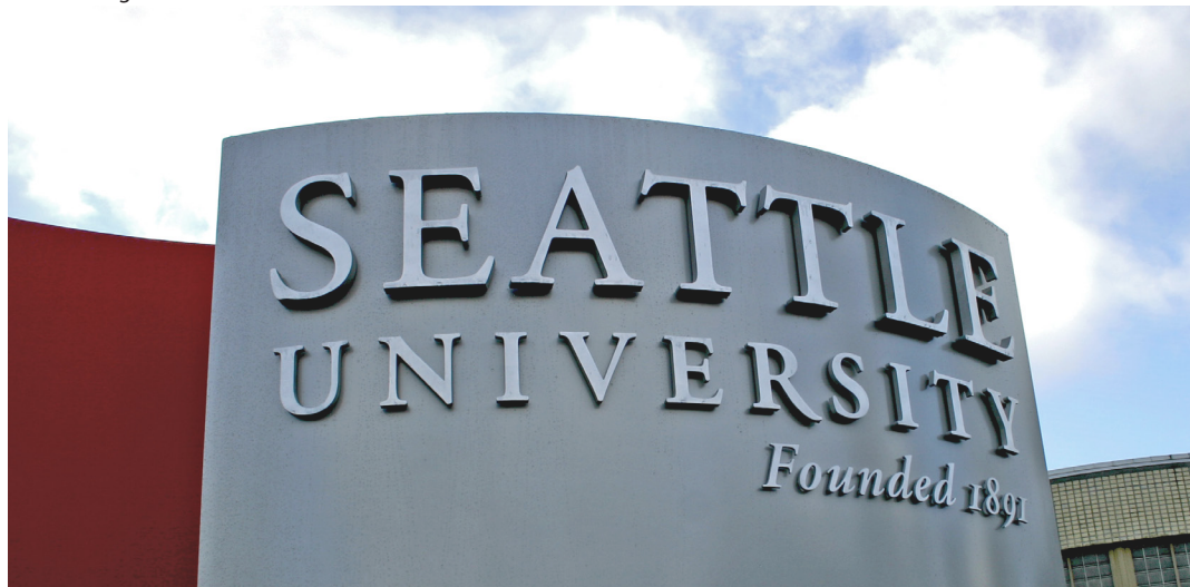
Entrance Sign on 12th and E. Marion St.

Seattle University strives to be a leader in sustainable practices for its grounds, buildings, operations, and education. It is devoted to respecting and caring for a healthy environment in the community. This means creating a campus that is friendly to animals and humans, reducing the campus' impact on the environment and educating individuals to have a global awareness. These practices are included in curriculum for future nurses, educators, engineers, scientists, business leaders, and policy makers.