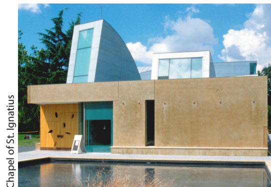
Chapel of St. Ignatius