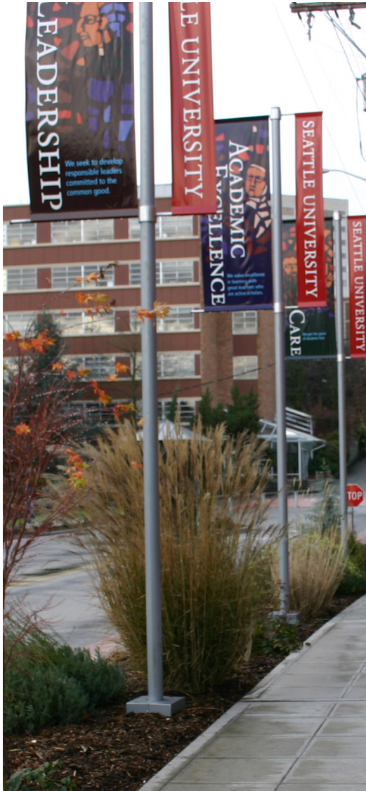
Entrance at 12th and E Marion