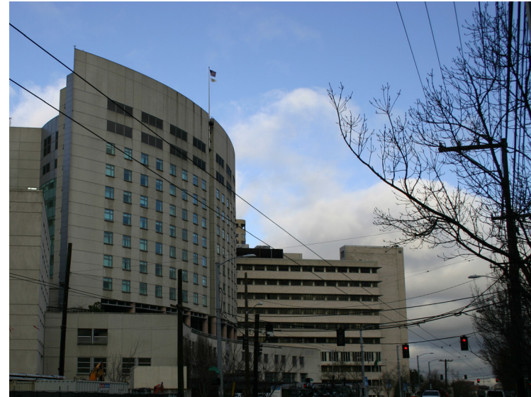
Swedish Medical Center

The Seattle University campus is also an education center for people of all ages, with the grounds setting the scene for group tours on sustainable practices and the Lee Center enriching minds with the fine arts. The University campus hosts lectures, debates, and films open to the public. The pedestrian walkways are used as throughways for neighborhood residents to the city center and neighborhood attractions. The existing relationships and activities described above are expected to continue throughout the life of this Major Institution Master Plan.