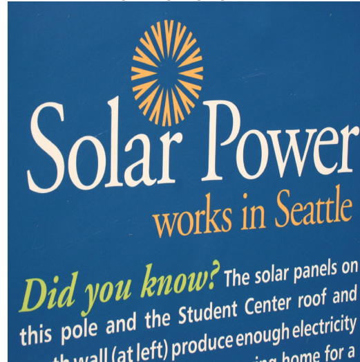
Awareness Building through Signage