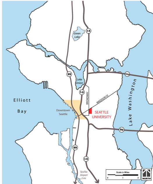
Seattle University's Location in Seattle