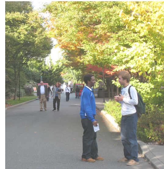
Students Conversing On Campus