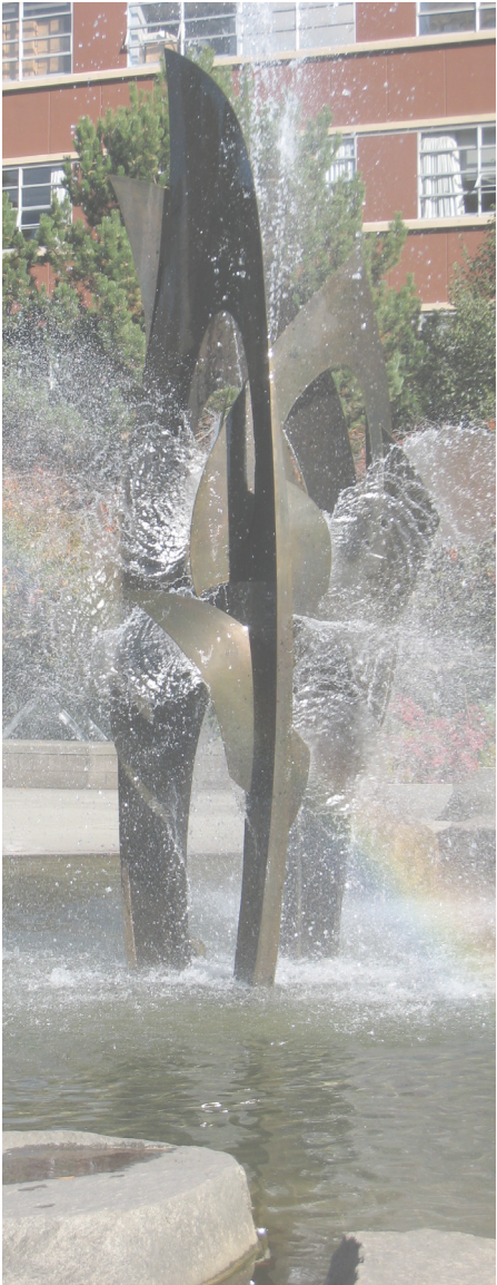
Fountain in the Quad

This Major Institution Master Plan covers the next few decades of growth for Seattle University.