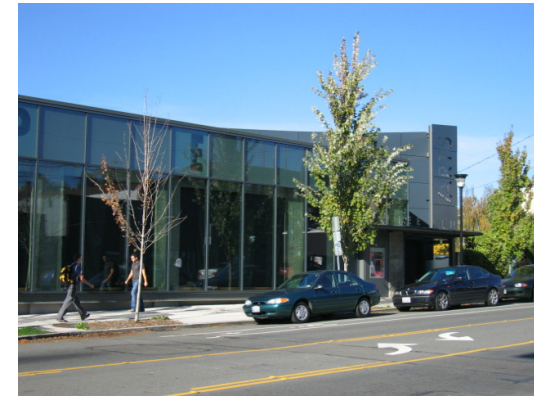
Lee Center for the Arts