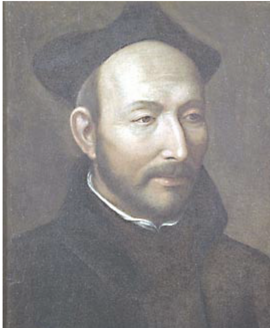
Images of Saint Ignatius of Loyola