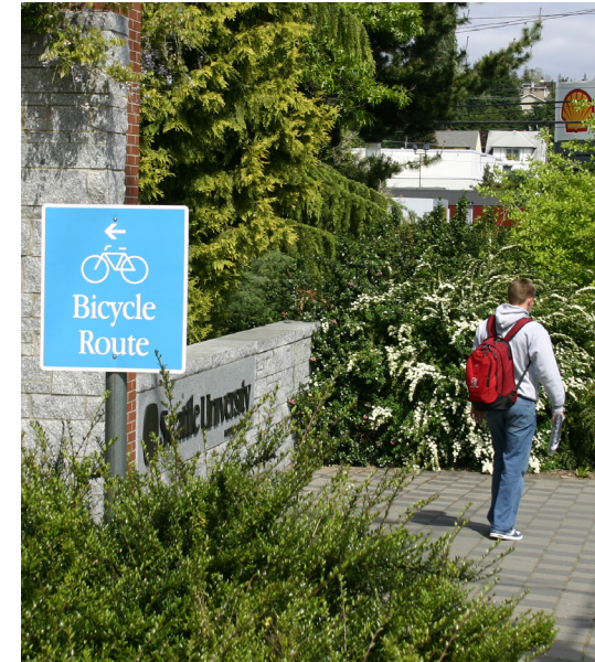
South Pedestrian Entrance