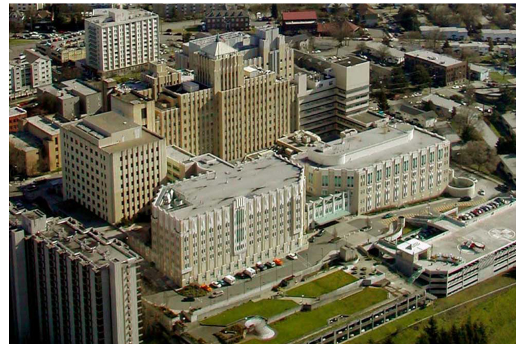
Harborview Medical Center